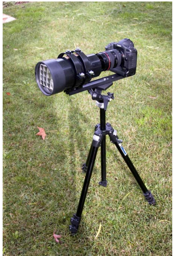
Figure 5: Our working model of the camera of Figure 2, with two positive lenses and an array of 20 negative lenses cut into squares.