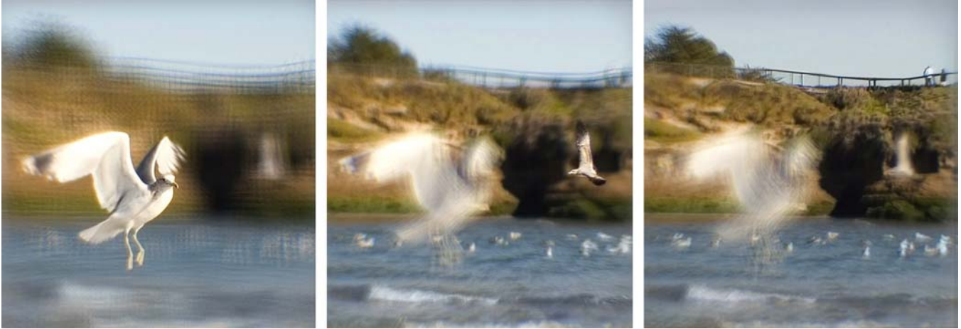
Figure 1: Seagulls in flight captured with our light field camera. We demonstrate refocusing on different depths after the picture has been taken. With conventional cameras the photographer has no time to focus on different objects of interest in a dynamic scene. (For view interpolated version that eliminates the artifacts of this example see Figure 6.)