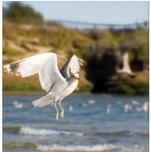
Figure 6: The seagull of Figure 1 after view interpolation to generate a dense light field and remove sampling artifacts.