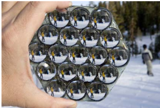
Figure 4: Picture of our hexagonal array of lenses and prisms creating 19 views of the scene.